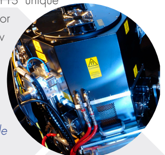
Rapier XE silicon etch module

If you would like to know more about the specific capability of SPTS's DSi-v or Rapier XE systems, please email enquiries@spts.com